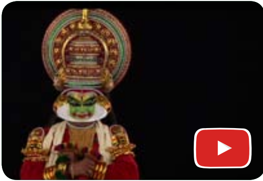
Kathakali Pacha Vesham