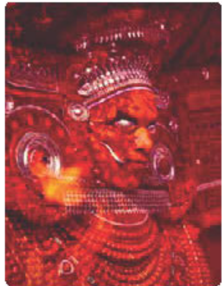
Kannur A Journey of Discovery and Enchantment