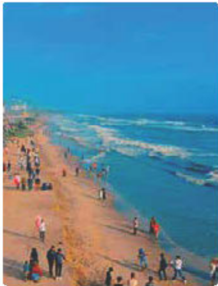
Kozhikode Hospitality at its Finest