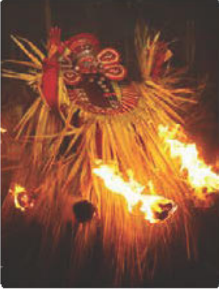
A chronicle of Kerala's Cultural Richness