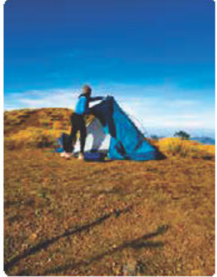
Go Camping in Kerala