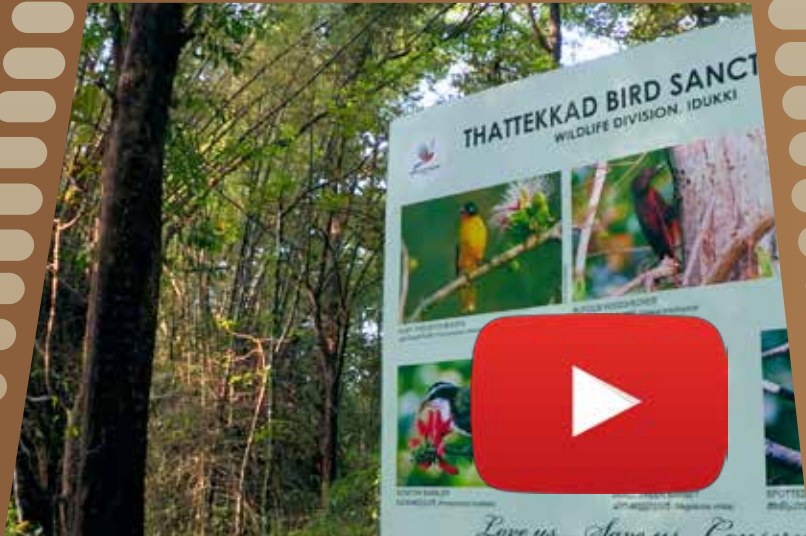
Thattekkad Bird Sanctuary