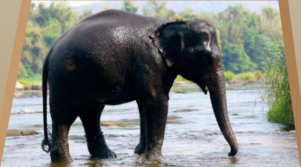
Baby Elephant at Kodanad