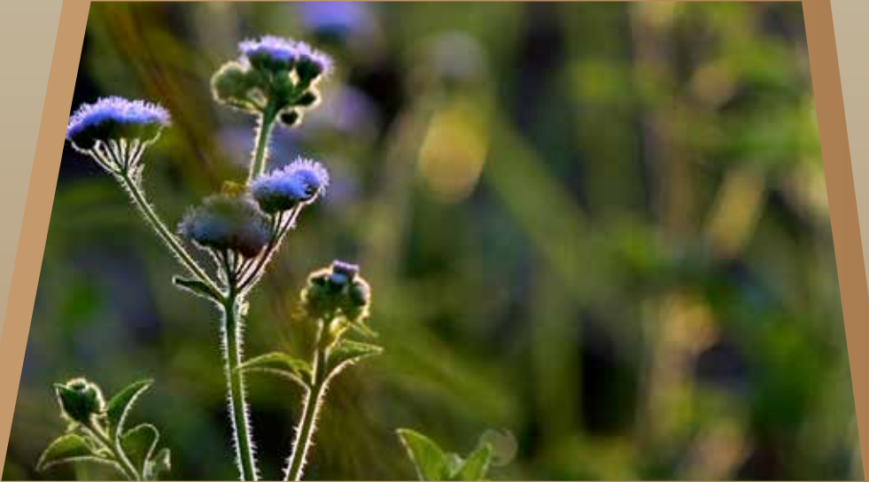
Magical blooms at Bhoothathankettu