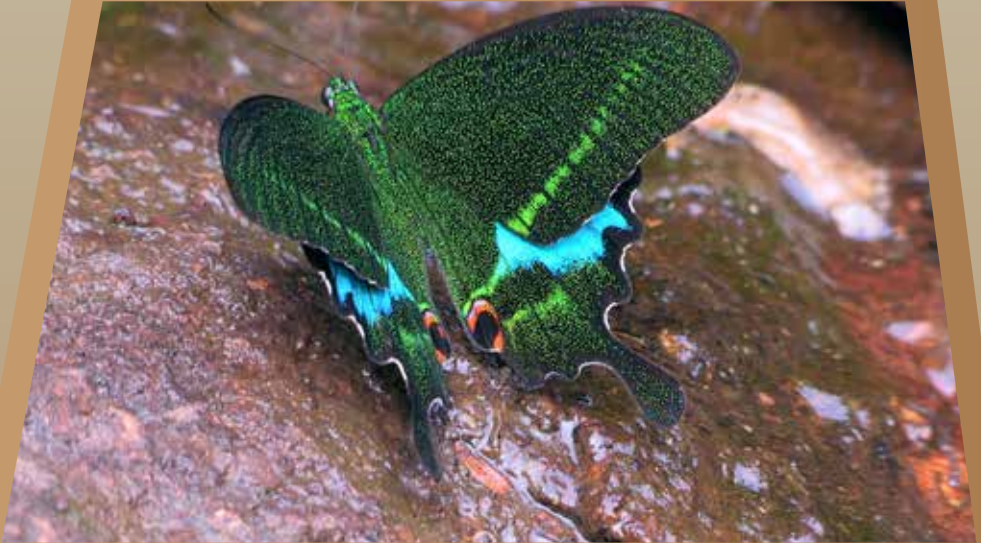
Paris Peacock Butterfly