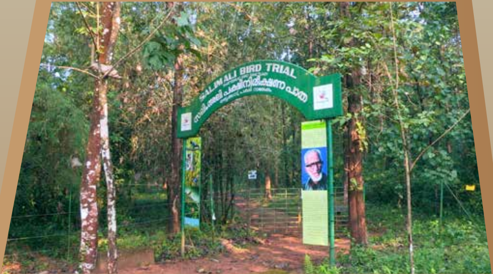
Thattekkad Bird Sanctuary