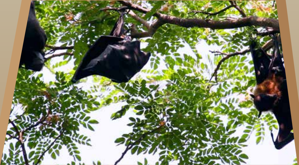
Mangalavanam Bird Sanctuary