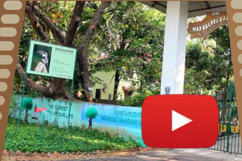
Mangalavanam Bird Sanctuary