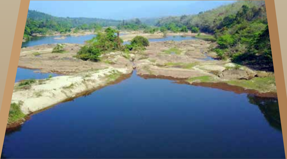
River Periyar in Bhoothathankettu