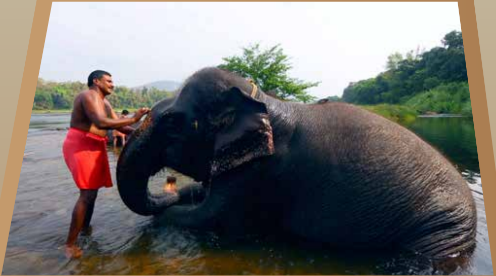
Elephants at Kodanad