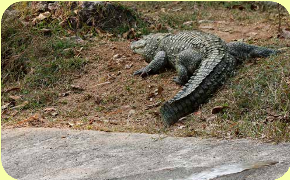
Crocodile Rearing Centre, Neyyar