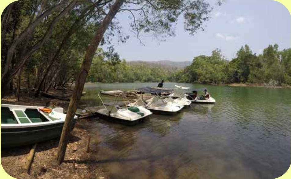
Pedal boats at Neyyar reservoir