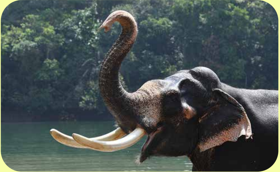
And the happy Jumbo at Kottur