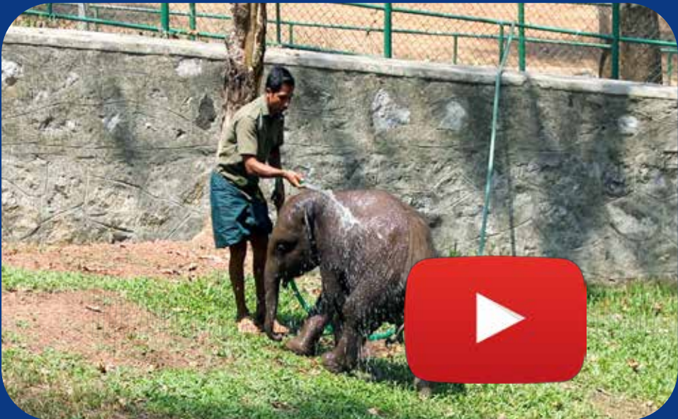
Elephant's day out