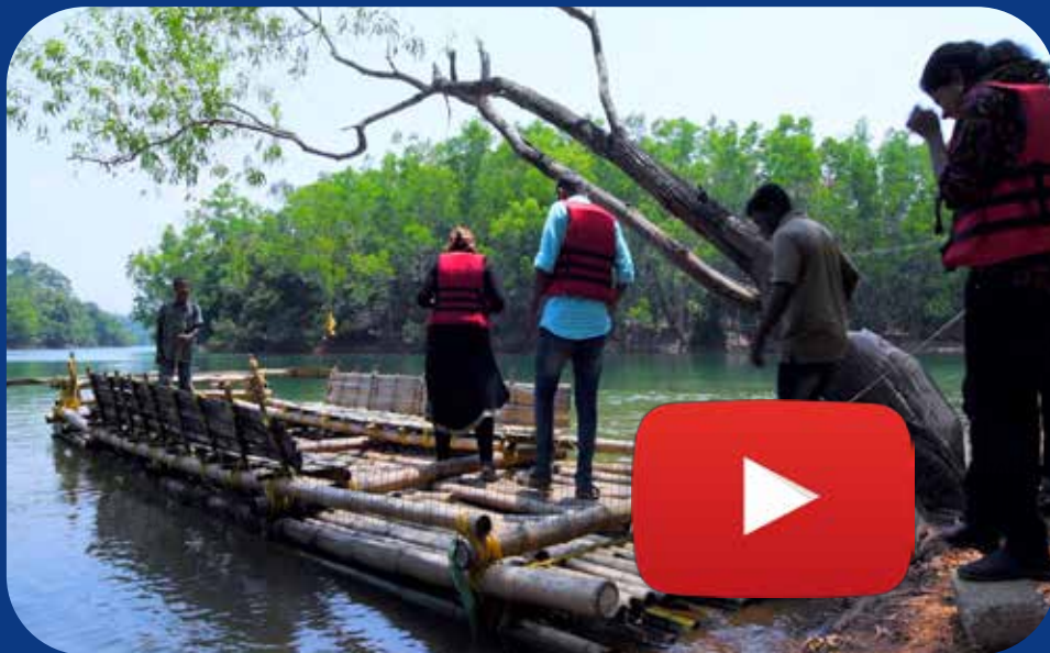
Bamboo Rafting at Kottur