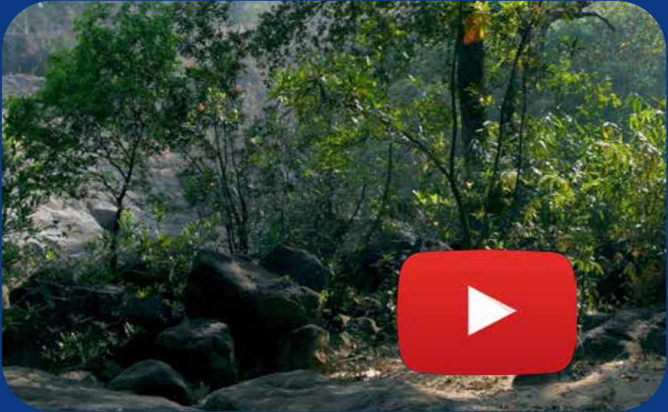
Meenmutty falls, Kallar