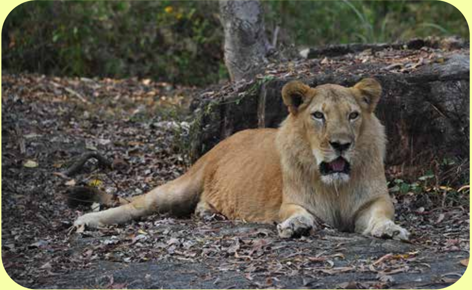
Safari at the Lion Park