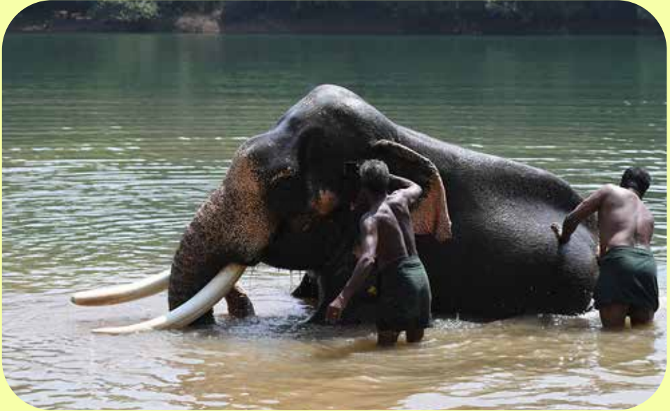
Its time for bath