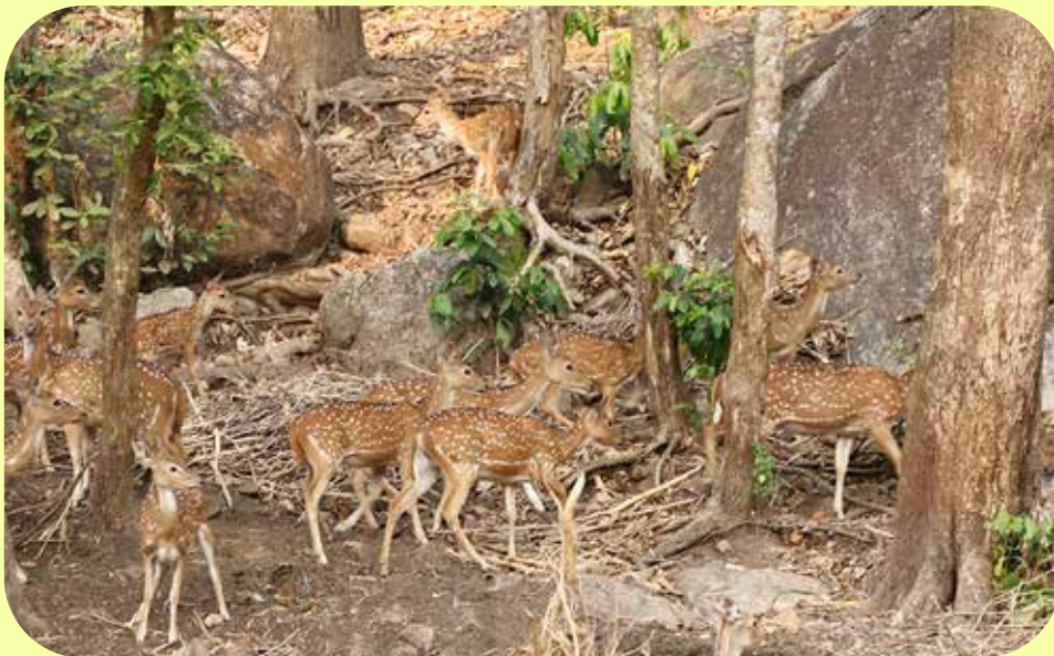
Deer Park at Neyyar