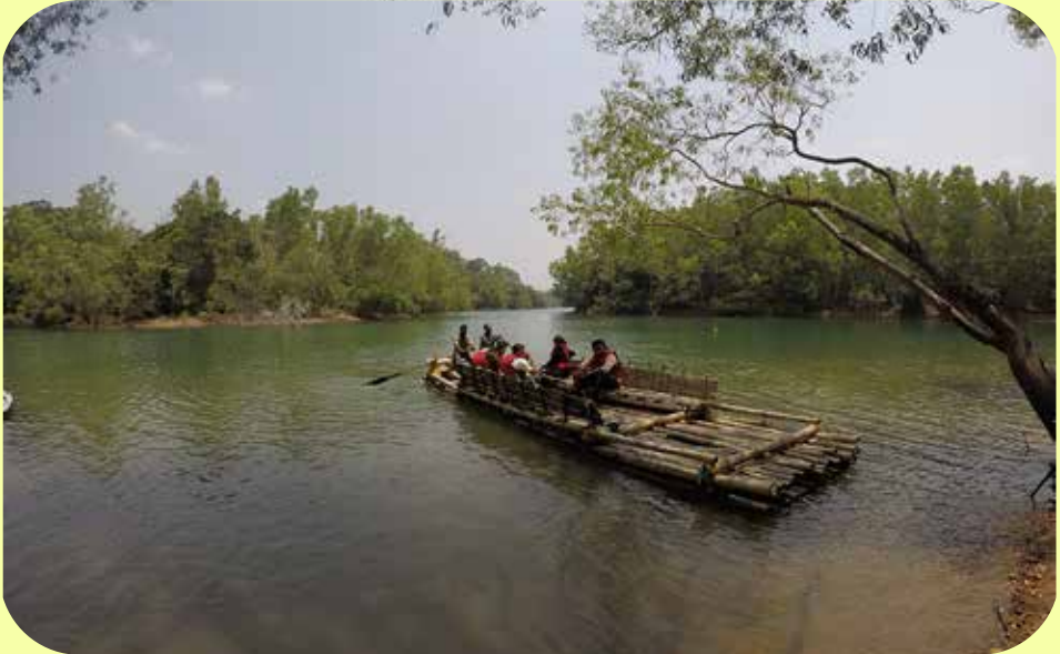
Visitors enjoying the bamboo rafting