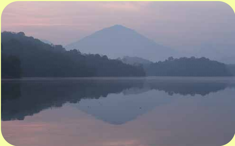
Tranquil Neyyar Reservoir