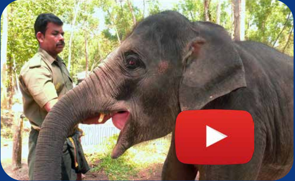
Feeding the elephants at Kottur