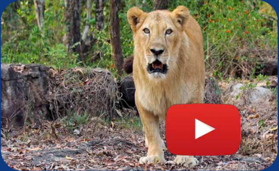
Lion Safari at Neyyar