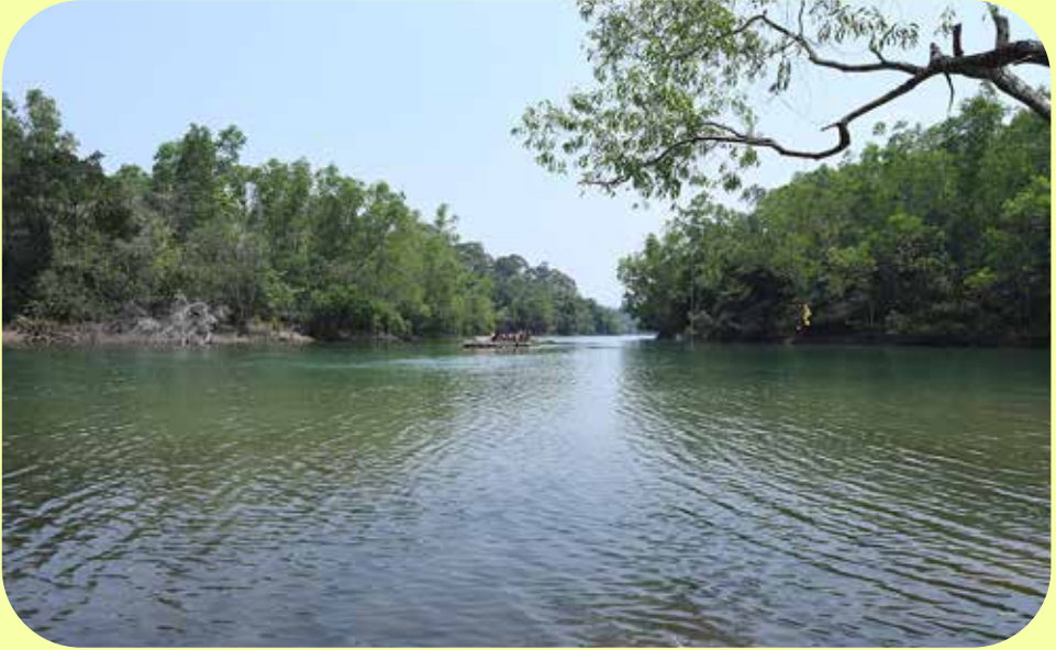
Bamboo Rafting, Kottur