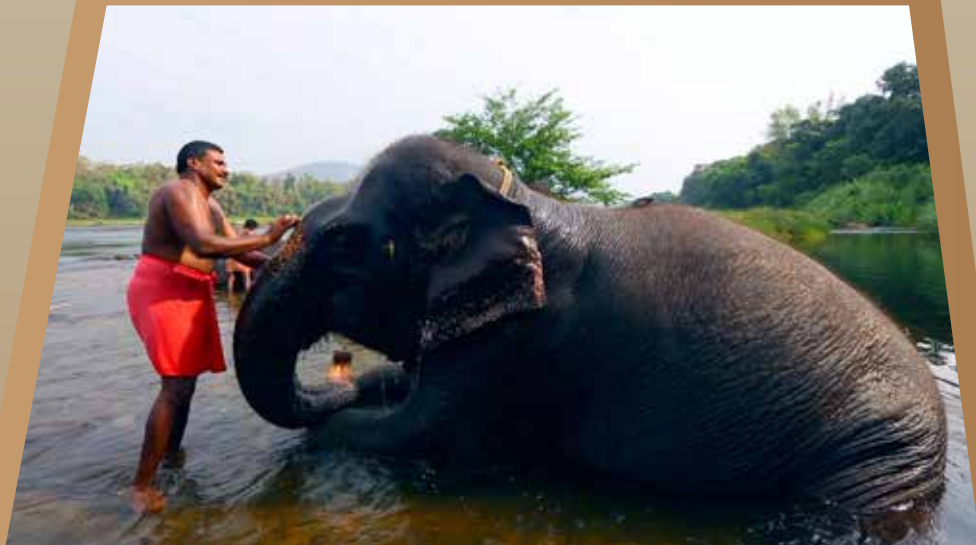
Elephants at Kodanad