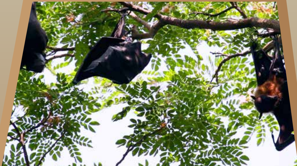
Mangalavanam Bird Sanctuary