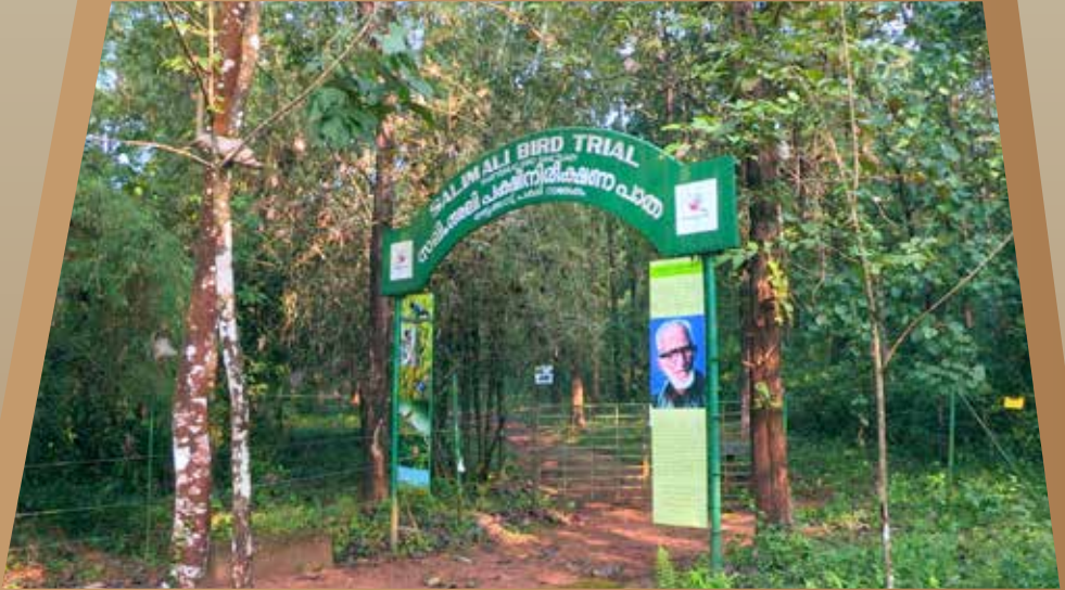
Thattekkad Bird Sanctuary