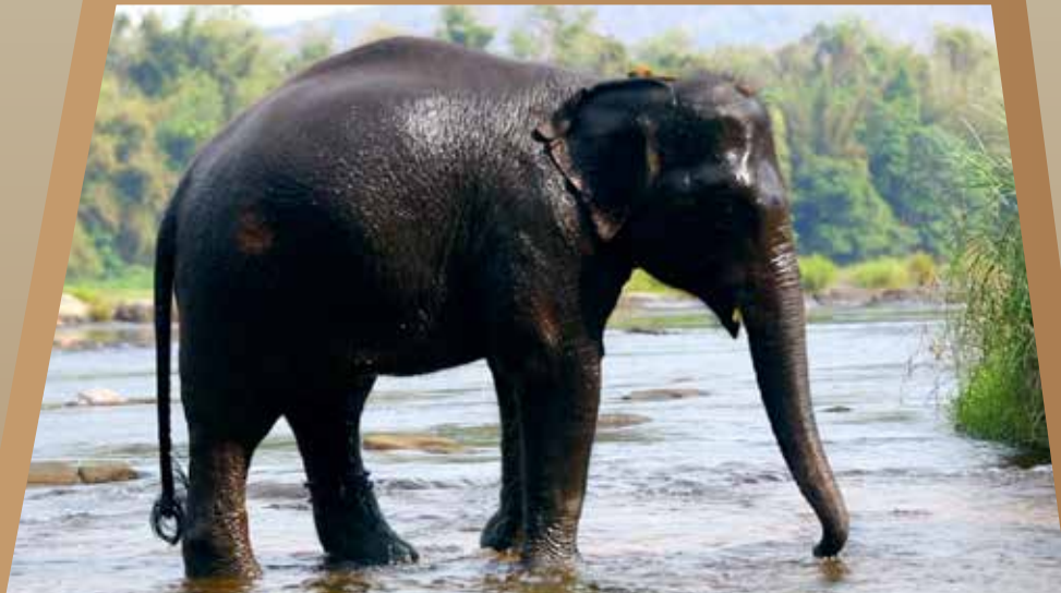
Baby Elephant at Kodanad