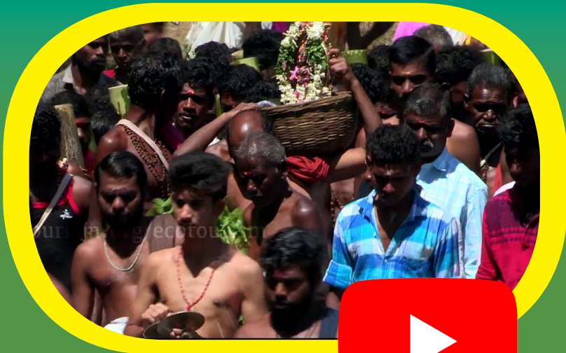
Malleshwara Temple Festival, Attappady