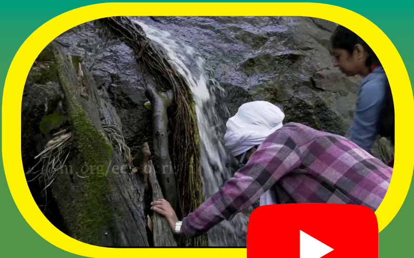
Trip to Sairandhri