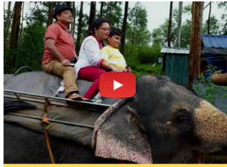
CARMELAGIRI ELEPHANT PARK, MUNNAR