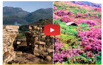
MARAYOOR AND NEELAKURINJI