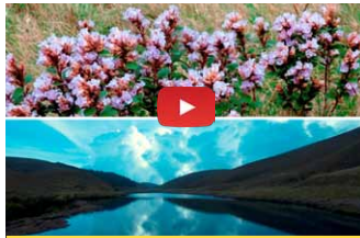
VALLEYS OF ERAVIKULAM AND NEELAKURINJI | KURINJI SEASON 2018