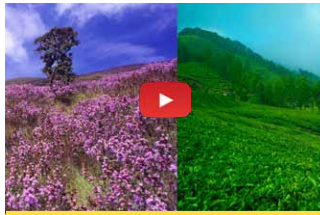
MUNNAR'S TEA PLANTATIONS AND NEELAKURINJI