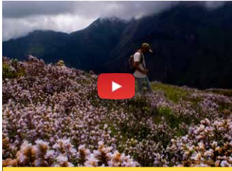
HOW TO REACH ERAVIKULAM FROM THRISSUR?