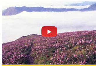
HOW TO REACH ERAVIKULAM FROM PALAKKAD?