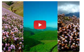
MUNNAR ON THE WAY IN SEARCH OF THE NEELAKURINJI