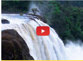
ATHIRAPPALLY & VAZHACHAL