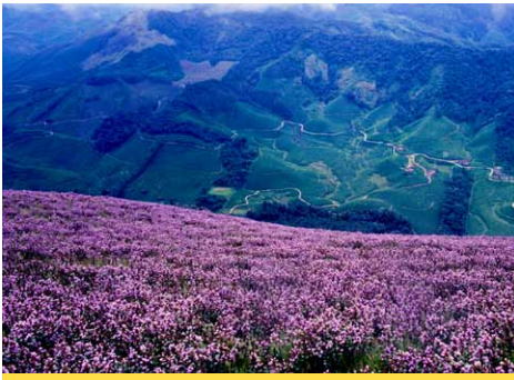
NEELAKURINJI - 1994