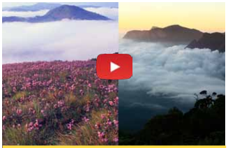
WHY TOP STATION, THE BEST PLACE TO VIEW KURINJI FLOWERS