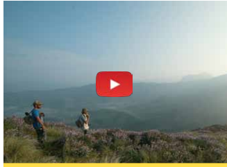
HOW TO REACH ERAVIKULAM FROM ALAPPUZHA?