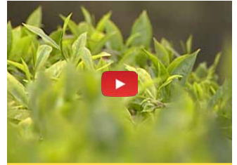
MUNNAR TEA FACTORY