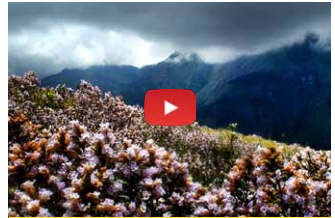
PLAN YOUR VISIT FOR THE NEELAKURINJI BLOOM