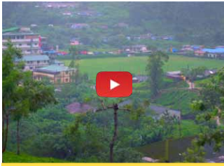
C.S.I. CHRIST CHURCH, MUNNAR