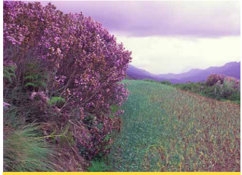
NEELAKURINJI - 1982