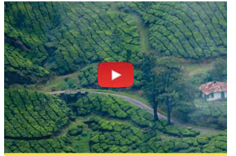
HOW TO REACH KERALA?