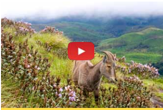
ENJOY THE VIEW OF NEELAKURINJI AND NILGIRI TAHR