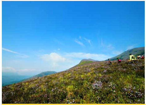
NEELAKURINJI - 2006