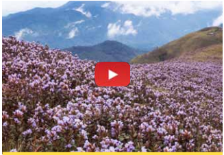
HOW TO REACH ERAVIKULAM FROM KUMARAKOM?