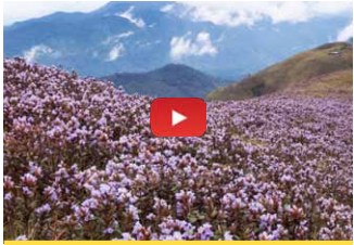
HOW TO REACH ERAVIKULAM FROM KUMARAKOM?