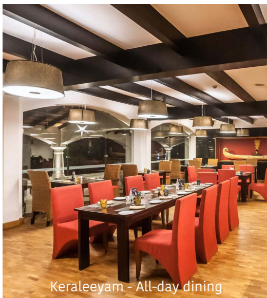
Keraleeyam - All-day dining